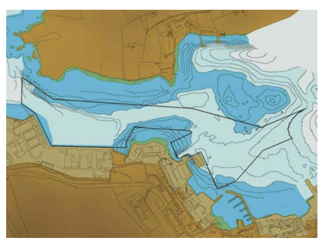
The graphic above shows the extent of the planned dredging.

The deeper and wider access will suit the larger vessels now operating at the Port and will create opportunities to bring a number of barges to the Port for future projects and move them from different, sheltered berths in the harbour to the decommissioning pad at Greenhead Base.